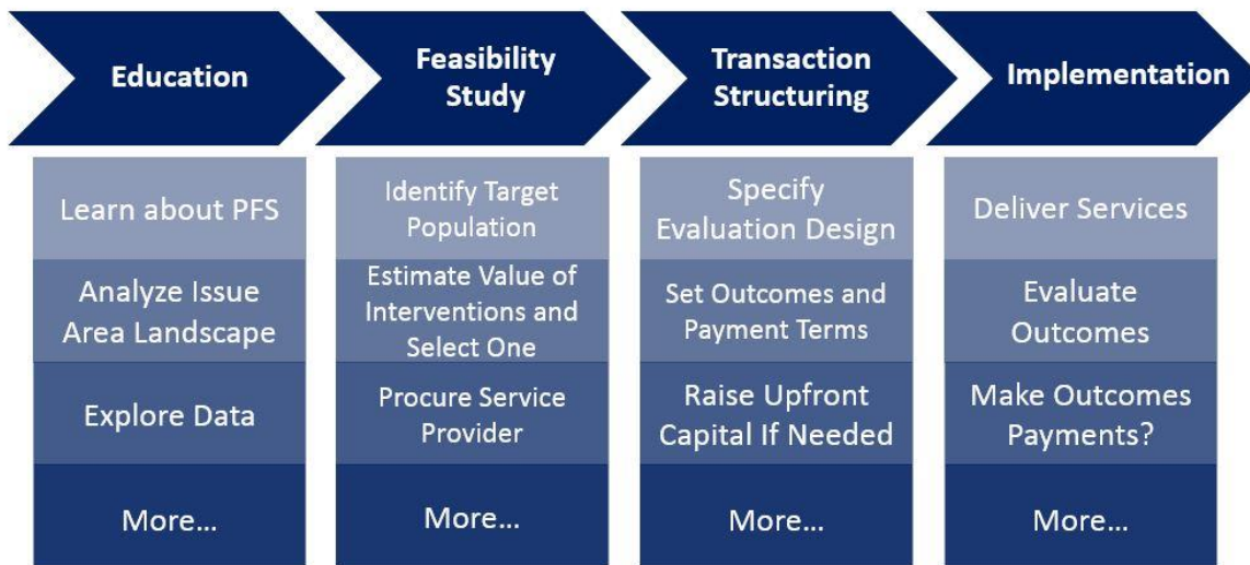
Figure 2: Stages of Development

The first stage – Exploration & Education – is dedicated to understanding PFS and the first projects, identifying one or more areas where a government or other entity would like to potentially apply PFS, and digging deeply into the entity’s data to understand what data is available (and ideally what it indicates) about the target population.