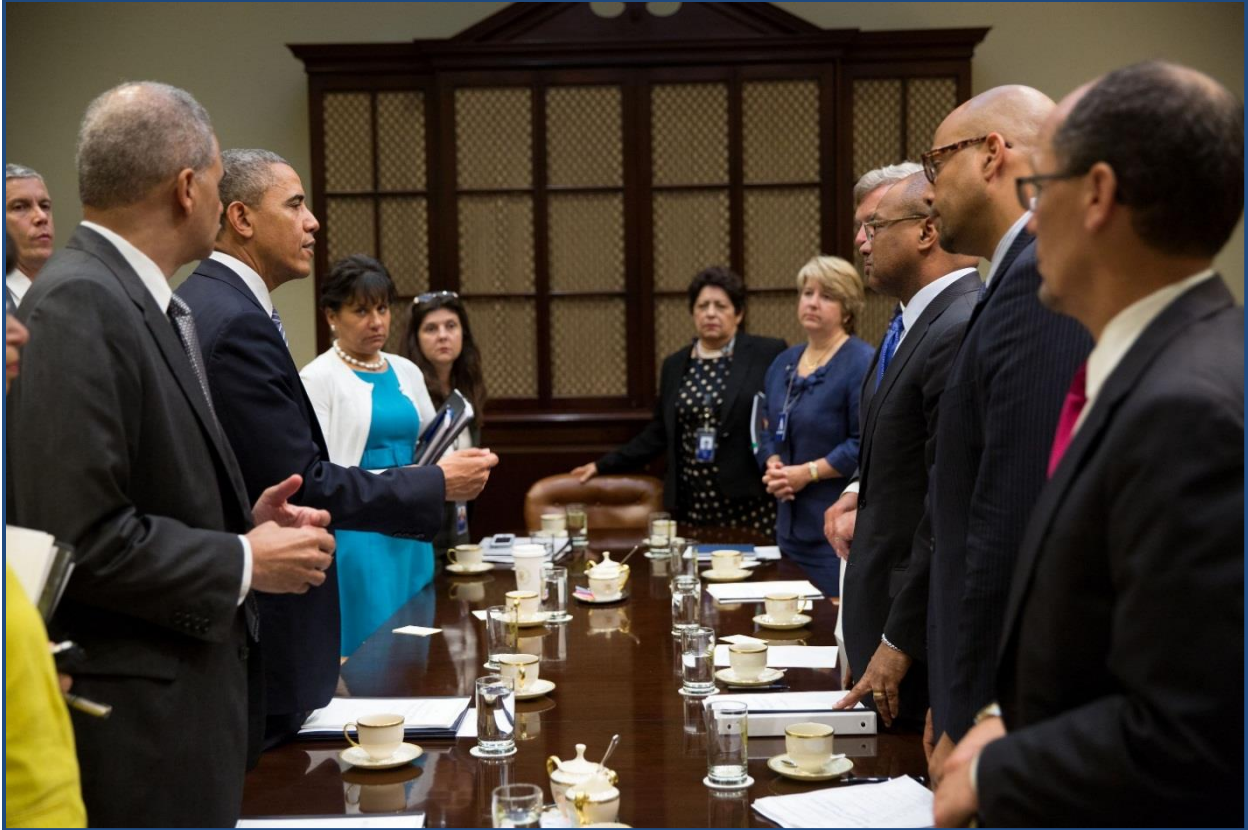
President Barack Obama meets with the My Brother's Keeper Task Force at the White House, May 30, 2014.