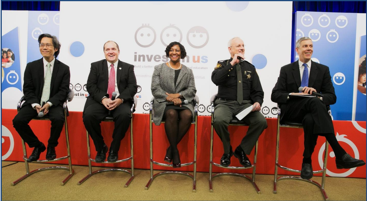
US Department of Education Secretary Duncan with local and private sector leaders at the White House Early Education Summit, December 10, 2014.