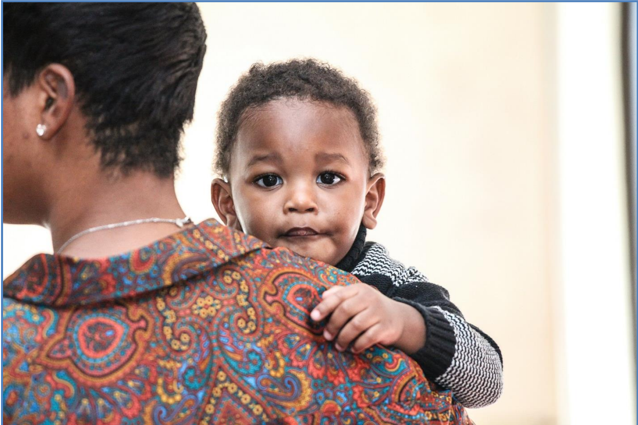
A young attendee at a My Brother's Keeper launch event in Newark, New Jersey, January 8, 2015.

The sections below outline the six milestone areas identified by the Task Force as the most impactful and effective intervention points of young people's lives--from their early years through young adulthood. Each section contains foundational perspectives on why each intervention point is so critical, and the types of work being done at the federal and local level to address the recommendations.