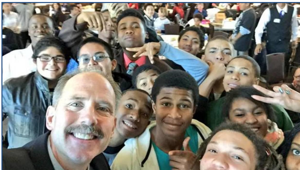
Mayor Richard Berry and local youth at a My Brother's Keeper Action Forum in Albuquerque, New Mexico, January 16, 2015.

Each Challenge Community has up to 180 days after accepting the Challenge to officially unveil its comprehensive action plan. The federal government does not sponsor, supervise, or independently evaluate the efforts of these localities. But the communities themselves have reported many encouraging signs of progress and momentum. Some of those independent efforts are highlighted below, with information received from the communities themselves, to provide a sense of the broad work being performed to help ensure all youth have the opportunity to realize their full potential.