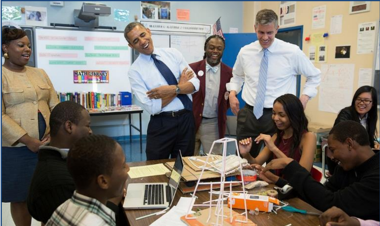
President Obama and U.S. Department of Education Secretary Duncan with students at the Technology Early College High School (P-TECH) in Brooklyn, New York, October 25, 2013.