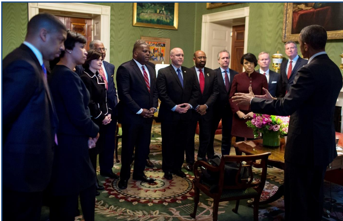
President Obama talks with mayors participating in the MBK Community Challenge at the White House, January 23, 2015.

The Department of Justice and other agencies worked together to promote community-oriented policing practices, improve trust between law enforcement and the communities they serve, and improve the overall life and educational outcomes for justice-involved youth.