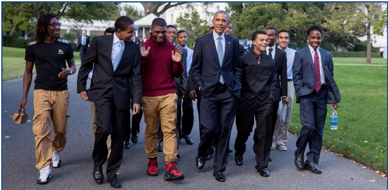
President Obama with youth from the White House Mentee program at the White House, October 2014.

The convergence of local place-based actions, federal policy-focused work, and independent private sector efforts all respond to the President’s MBK call to action. As civic and city leaders try to meet the challenges of addressing the needs of at-risk populations at a local level, policy makers, the private sector and philanthropy are providing structural and financial assistance needed to stand up what works. Through MBK, this Administration will continue to improve transparency and accountability to address persistent opportunity gaps at every level. We will continue to identify new strategies and practices being put in place to address gaps in academic performance and solidify pathways to the middle class and beyond. We will continue to study how disciplinary actions disproportionately derail boys and young men of color and other students, and may place them on the so-called school-to-prison pipeline. Overall, we will continue our work across America to improve life outcomes for all young people in their communities and ensure all children have opportunities to succeed.