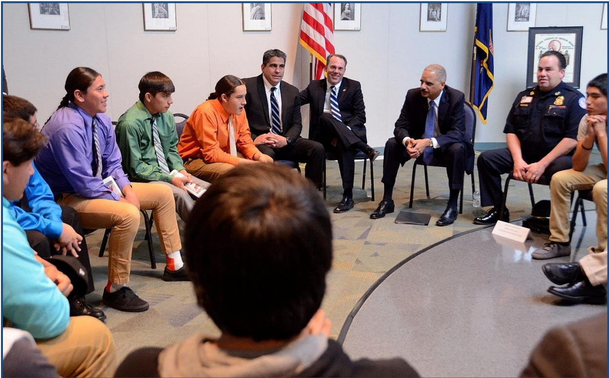
Attorney General Eric Holder meets with Indian Tribe youth in Bismarck, North Dakota, June 5, 2014.

In November 2014 , the Oneida Tribe of Indians of Wisconsin hosted the first MBK Community Challenge event in Indian country. Smoke dancers kicked off the program that included local leaders, students, and community organizations. Oneida also participated in a Native American Task Force convened by the National Congress of American Indians (NCAI) to advance the goals of the MBK initiative in Indian country.