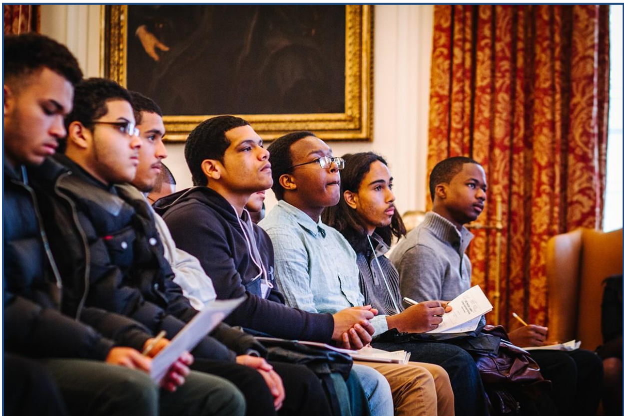
Participants in the UBS NextGen Leaders program, June 20, 2014.

The operational approach that Houston is applying to address MBK priorities is modelled after their successful campaign to reduce, and eventually end, veteran homelessness – part of the Obama Administration’s Mayors Challenge to End Veterans’ Homelessness launched by First Lady Michelle Obama in June 2014. Houston has connected 1,402 individuals to permanent supportive housing and reduced the unsheltered homeless population by 50 percent. As with this housing program Houston intends to monitor outcomes associated with its MBK Community Challenge initiatives, in order to assure measurable results and sustainable success for all youth.