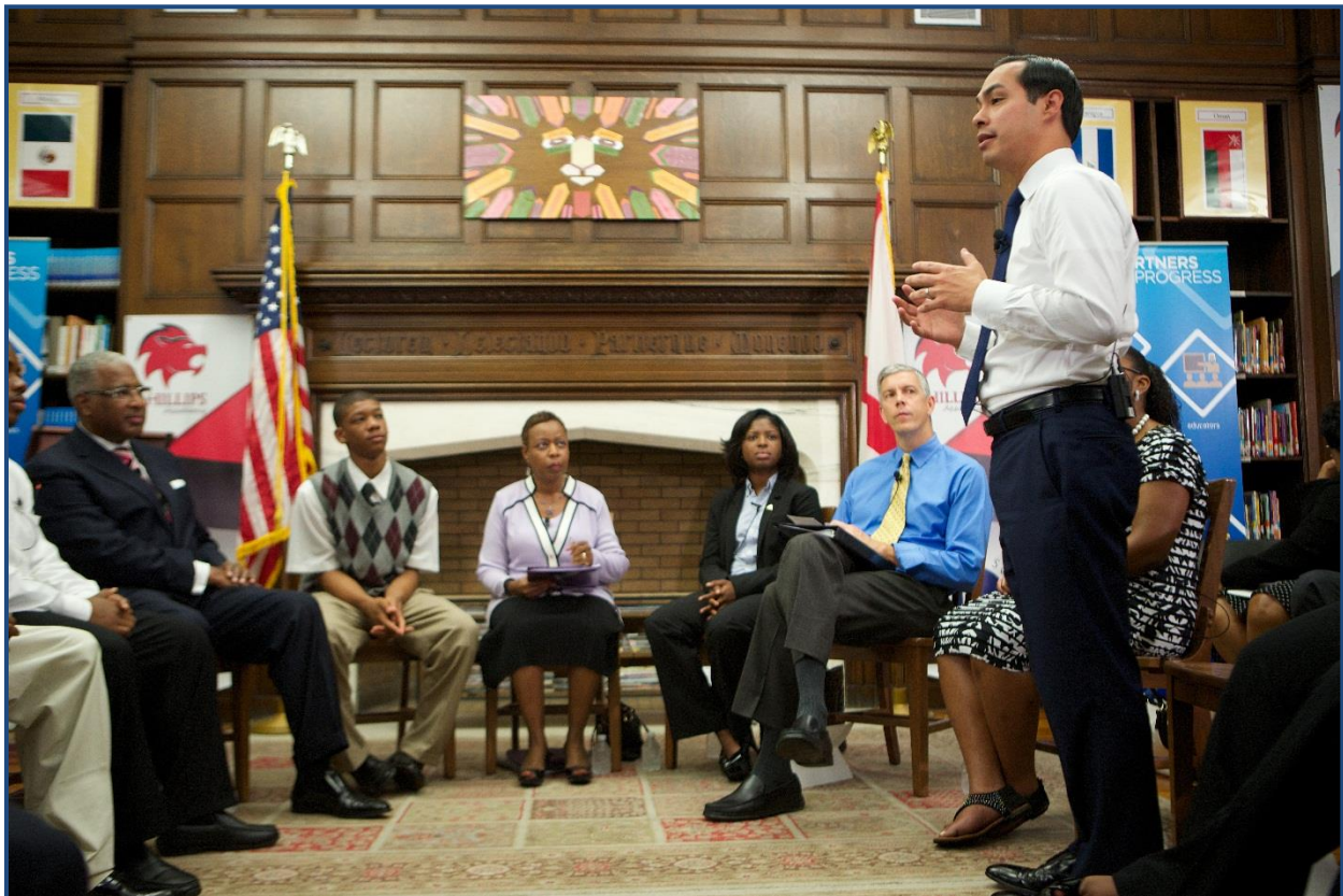
U.S. Department of Housing and Urban Development Secretary Julian Castro and U.S. Department of Education Secretary Duncan meet with Mayor Bell and community members in Birmingham, Alabama, September 9, 2014.

The Department of Education's Office for Civil Rights (OCR) is vigorously enforcing federal civil rights laws to ensure students are not inequitably disciplined based on their race, national origin, disability, or gender. OCR has recently reached robust agreements with school districts across the country to address discriminatory discipline. These agreements often include commitments to provide training for staff and administrators to recognize discriminatory discipline practices, review and revise district codes of conduct, and develop alternative discipline strategies aimed at eliminating discriminatory discipline practices and reducing the amount of instructional time missed by students.