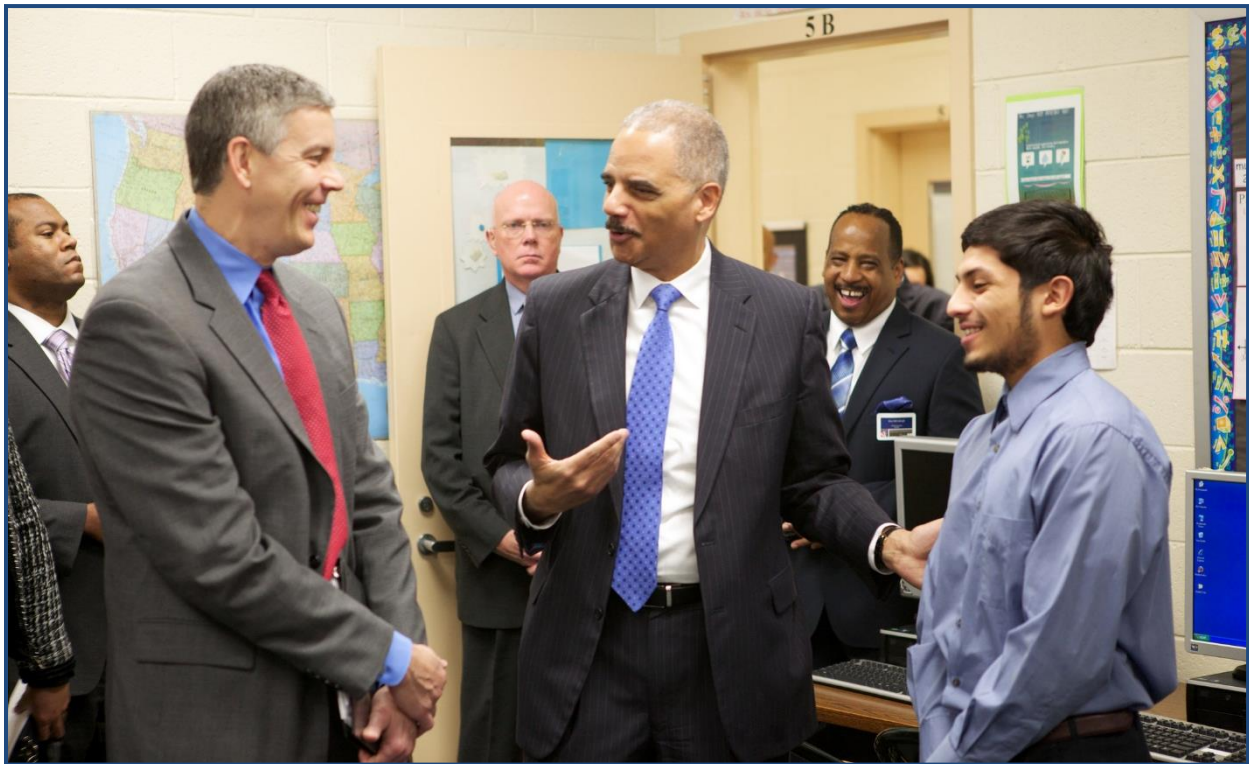
U.S. Department of Education Secretary Duncan and Attorney General Holder meet with youth and staff at the Northern Virginia Juvenile Detention Center School in Alexandria, Virginia, December 8, 2014.

In December 2014, U.S. Secretary of Education Arne Duncan and U.S. Attorney General Eric Holder announced a Correctional Education Guidance Package aimed at helping states and local agencies strengthen the quality of education services provided to America's estimated 57,000 young people in confinement every day. 41 This guidance package builds on recommendations in the MBK Task Force report to reform the juvenile and criminal justice systems to reduce unnecessary interactions for youth and to enforce the rights of incarcerated youth to a quality education. The guidance package is a roadmap that states and local agencies can use to improve the quality of educational services for confined youth.