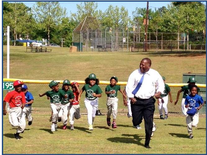
Mayor Steve Benjamin with youth in Columbia, South Carolina.