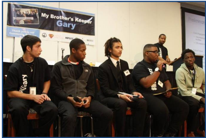
Youth at a My Brother's Keeper forum in Gary, Indiana.