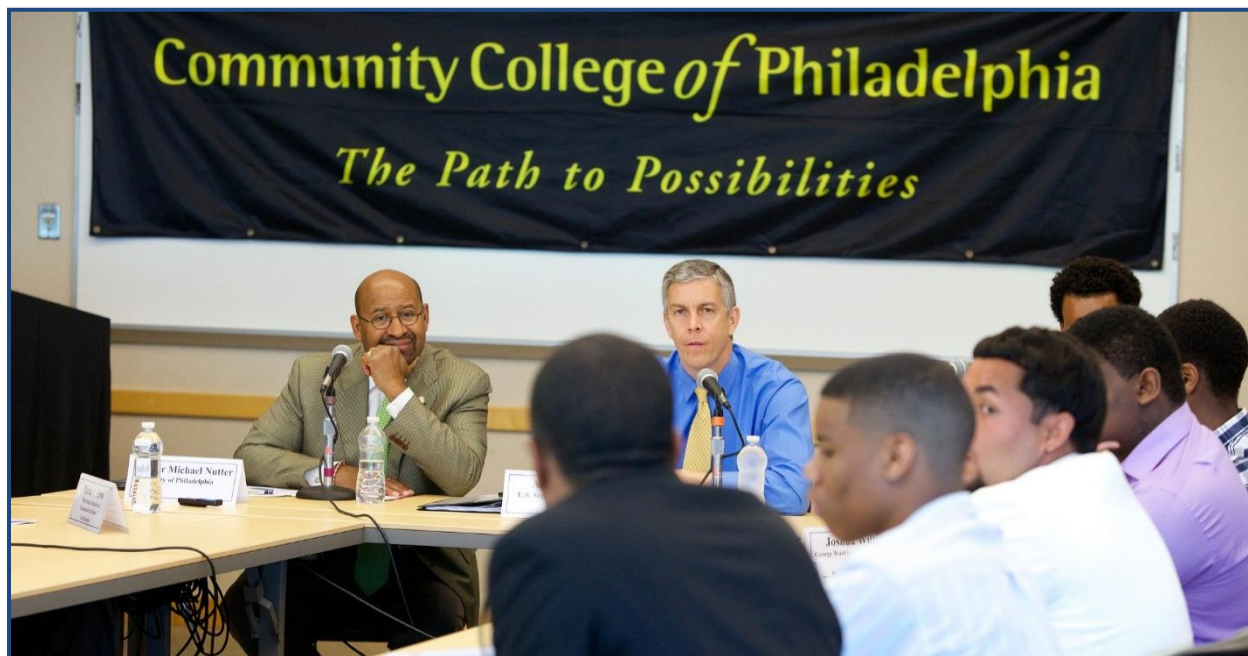
U.S. Department of Education Secretary Duncan and Mayor Michael Nutter at a My Brother’s Keeper roundtable discussion in Philadelphia, Pennsylvania, July 11, 2014.

Later in November , the city hosted the first-ever MBK Youth Hackathon at String Theory Schools in center city, Philadelphia. The nongovernmental program, supported by Qeyno Labs and #YesWeCode, drew 95 participants (ages 13-20) to form teams and build apps focused on one of five tracks: education, health and wellness, restorative justice, food and sustainability, and masculinity. Each team spent approximately 54 hours taking their idea from concept to demo, and presented before a panel of judges and their peers.