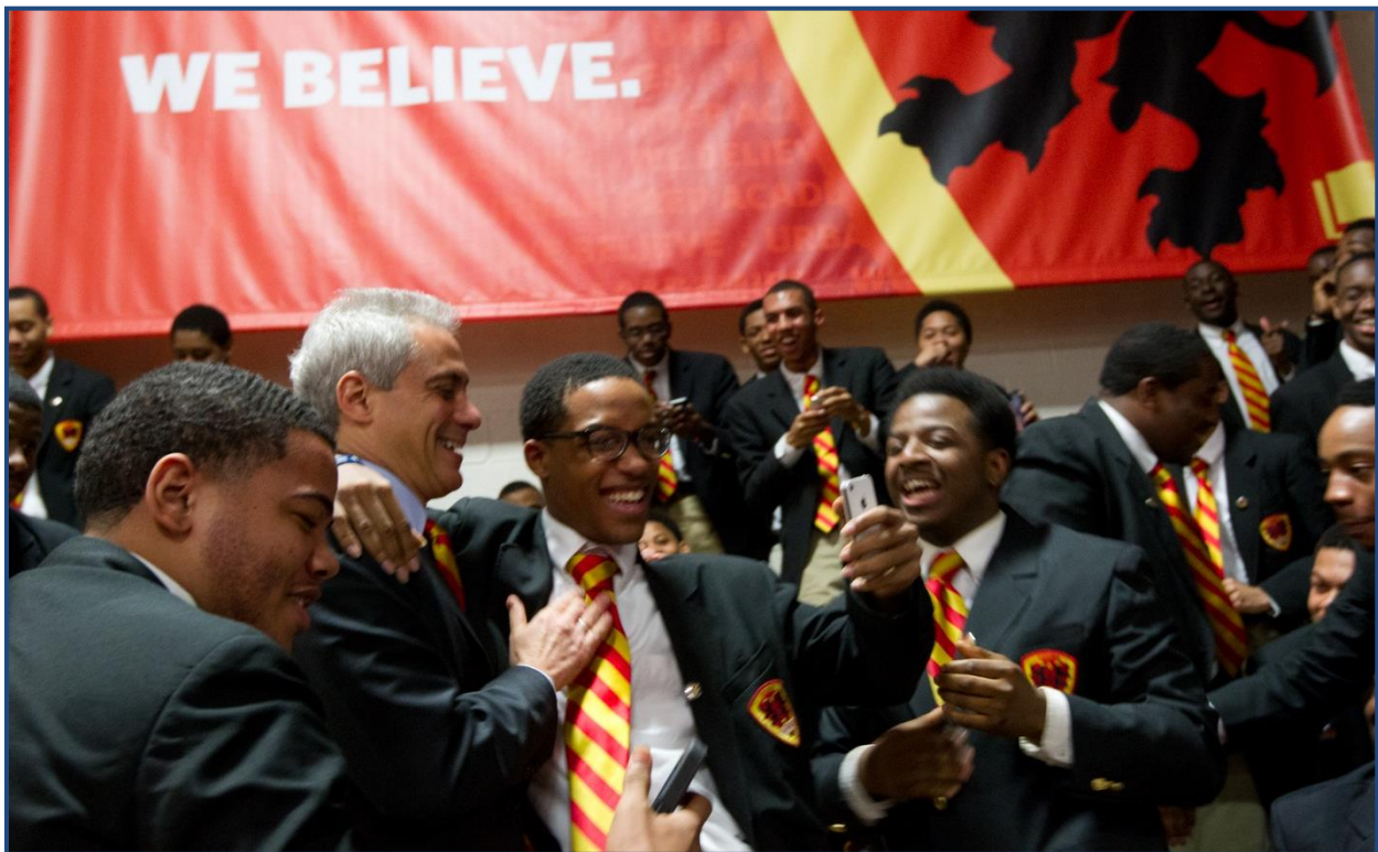
Mayor Rahm Emanuel and members of the Urban Prep Academy Class of 2014 in Chicago, Illinois, April 8, 2014.

In January , Mayor Walsh launched the Mayor's Mentoring Movement, an initiative in collaboration with Mass Mentoring Partnership to recruit 1,000 new caring adult mentors for Boston's youth. The target timeframe to meet the recruitment target is two years. At least 10 percent of the volunteers will be city of Boston employees. The effort will offer new empowering relationships for boys and girls ages 7 through 18.