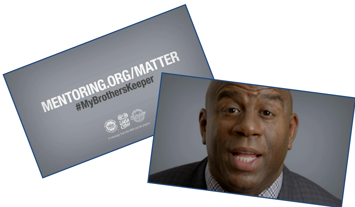
Stills from the "My Brother's Keeper: Be Someone Who Matters to Someone Who Matters" public service announcement.

Individual teams throughout the NBA are following suit and rolling out programs that amplify the NBA's overall commitment to action. For example, on January 11, the Memphis Grizzlies celebrated Mentor Night and premiered the "I Was That Kid" campaign, a player PSA initiative to support mentoring as a vital tool for student success. The campaign's call to action is one aspect of efforts to further mobilize mentor recruitment in Memphis, with a target of 5,000 new mentors by 2020. As part of the initiative, mentors and mentees will be given vouchers to enjoy healthy variations of traditional game day food.