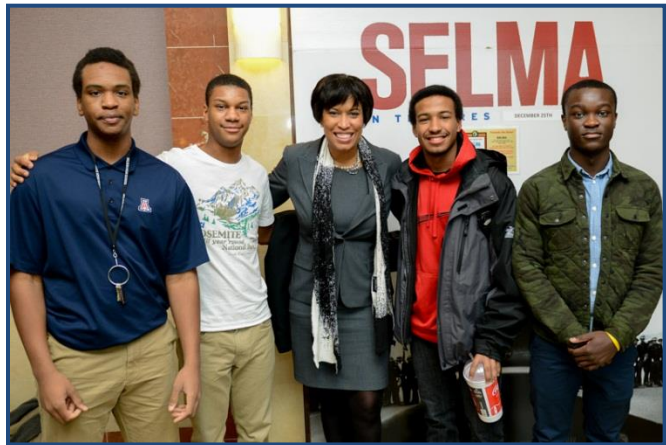
Mayor Muriel Bowser with students at a viewing of the film "Selma" in Washington, D.C.