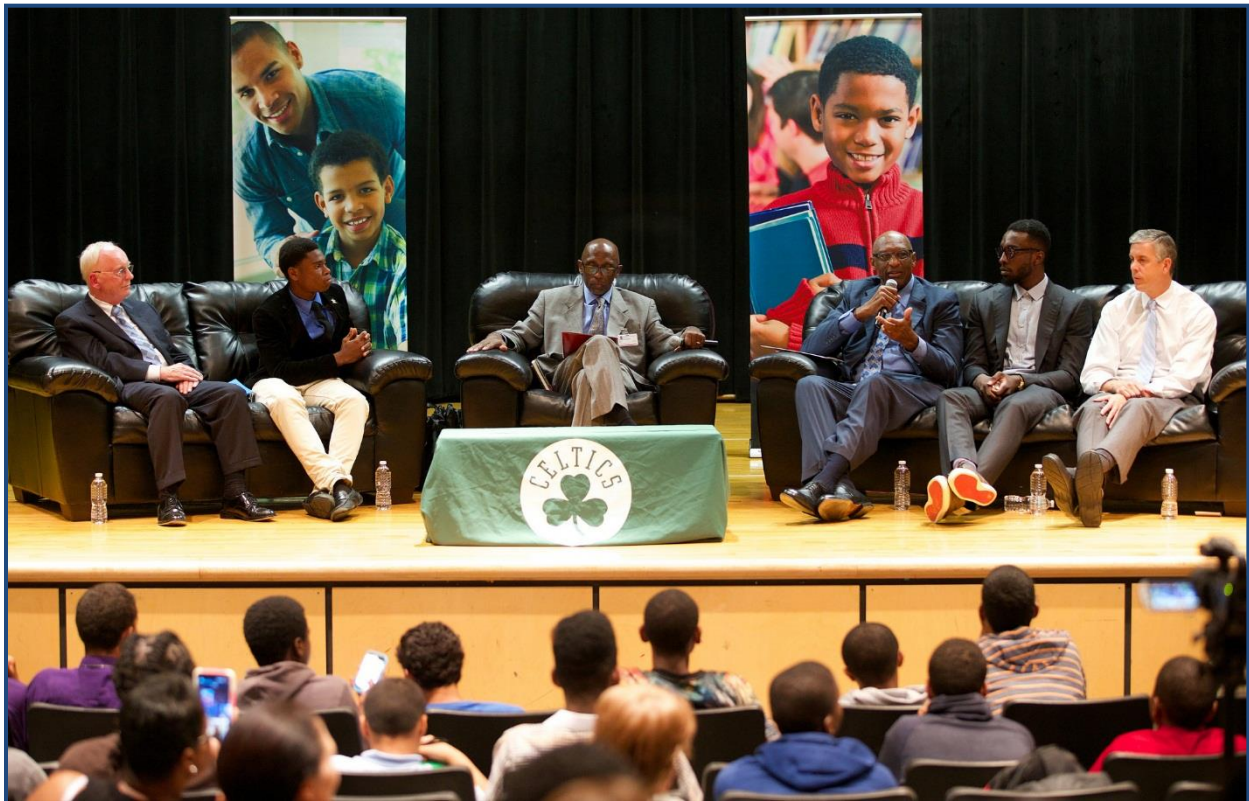
U.S. Department of Education Secretary Arne Duncan and members and staff from the Boston Celtics basketball team at a My Brother's Keeper town hall meeting in Boston, Massachusetts, September 18, 2014.

In January 2015 , Albuquerque held its local action summit in partnership with the Albuquerque Public School (APS). The summit brought together youth, community leaders, policymakers, and community members in a community conversation aimed at improving life outcomes for all youth. The feedback, comments, and information gathered at the event are now guiding the work of the district's newly formed Office of Equity and Engagement.