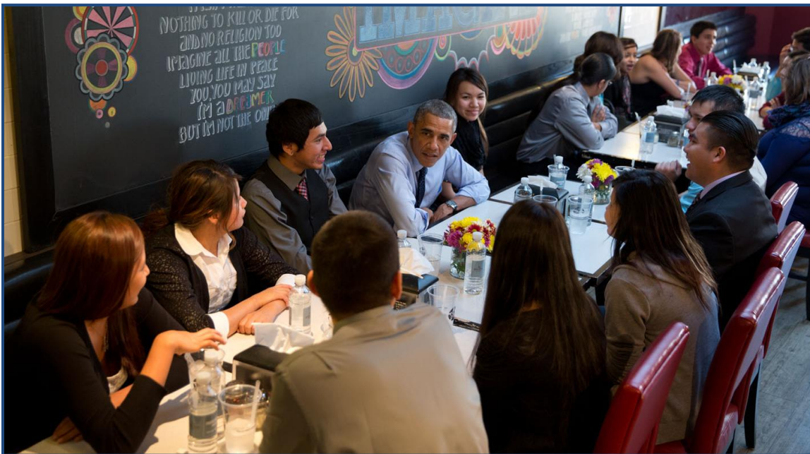
President Obama & youth from the Standing Rock Sioux Tribe in Cannon Ball, North Dakota, November 20, 2014.

In addition, the Obama Administration has been working to lead by example when it comes to the importance of mentoring. In May, when the MBK Task Force released its 90-day report, the President also called on all Americans to pledge to mentor, directing them to a place to find opportunities through serve.gov partner Mentor.org . Many accepted that call, which is now being taken to the next level by Mentor, through its independent efforts in partnership with the NBA. Additionally, the White House has renewed and expanded its own mentoring program , which has paired more youth from D.C. Public Schools with White House staff mentors. These young people and their mentors communicate on a regular basis and meet for monthly workshops and several service projects throughout the year. Some federal agencies have created their own mentoring programs. For example, the Department of Transportation (DOT) joined with an after-school tutoring program, so DOT employees can volunteer to mentor students from local schools.