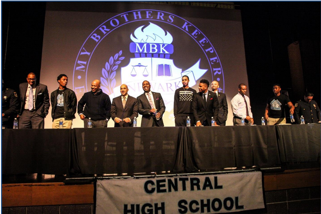
Mayor Ras Baraka and other dignitaries at a My Brother's Keeper forum in Newark, New Jersey, January 6, 2015.