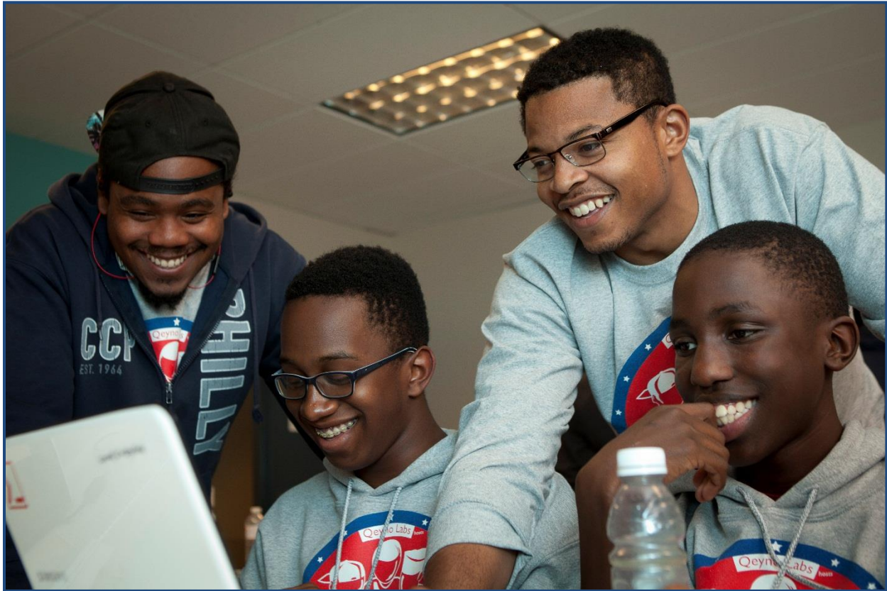
Students at the My Brother's Keeper Hackathon in Philadelphia, Pennsylvania, November 2014.

specialized services will prepare individuals for employment while they are incarcerated to increase their opportunities for successful reentry into their communities upon release. LEAP builds on promising strategies being implemented in a number of correctional facilities across the country, including the MontgomeryWorks Satellite One-Stop Career Center/American Job Center within the Montgomery County, Maryland county jail system.