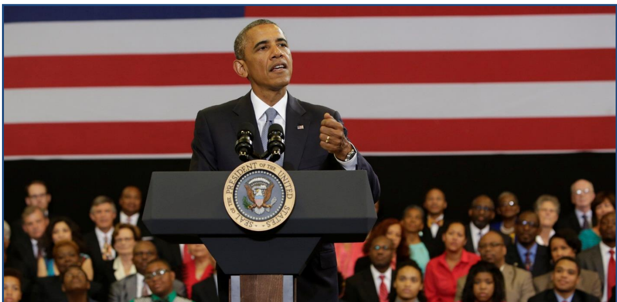
President Obama at a My Brother's Keeper town hall meeting with youth and superintendents at the Walker Jones Education Campus in Washington, D.C., July 21, 2014.

On July 21, 2014, at a youth town hall in Washington, D.C., President Obama announced additional private-sector commitments. Private sector leaders, including AT&T Chairman and CEO Randall Stephenson, NBA Commissioner, Adam Silver, and the President of the NBA Players Association, Chris Paul, announced specific commitments from their respective organizations. Alongside federal, state, and local government efforts, these independent private sector programs and platforms will further expand opportunities for learning, mentorship, volunteerism, and jobs for all youth, including boys and young men of color.