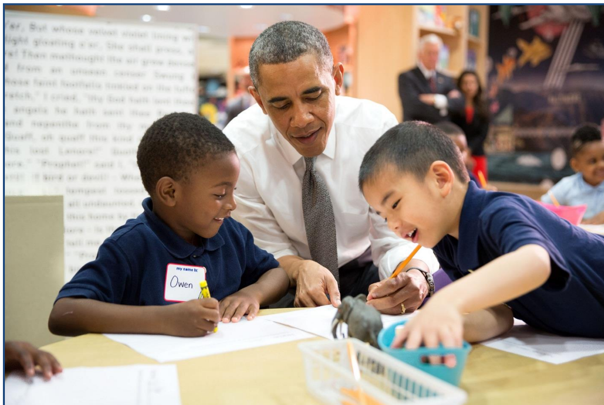
President Obama with students at Moravia Elementary School in Baltimore, Maryland, May 17, 2013.

In December 2014, HHS and ED issued a joint policy statement that provides recommendations to states and early childhood programs intended to prevent, severely limit, and eventually eliminate expulsion and suspension practices in early learning settings. Recommendations included establishing fair and developmentally appropriate policies and implementing those policies without bias and investing and implementing enhanced prevention programs. To accompany the policy statement, HHS also announced a $4.4 million investment in early childhood mental health consultation, an evidence-based practice with demonstrated effectiveness in reducing expulsion and suspension, increasing children's social skills, improving teacher-child interactions and classroom climate, and decreasing teacher stress and turnover. HHS and ED have begun wide dissemination of the policy statement through a series of targeted webinars for state and local leaders around the country.